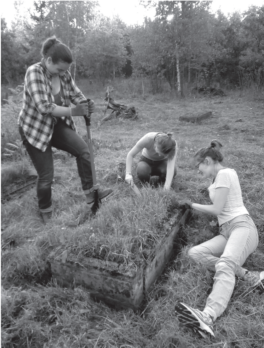
Figure 4: Students working on the cemetery of Wilken/Wilki, 2018