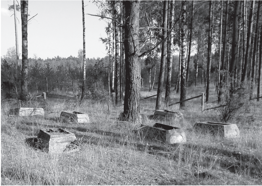
Figure 3: Cemetery of Groß Pasken/Paski Wielkie, 2017 Author: Sabine Grabowski

The history of the lost villages is all but unknown to Masuria’s current inhabitants. As a consequence of World War II, the expulsion of the Germans and the forced resettlement of Poles and Ukrainians coming from formerly eastern Polish territory that is today part of Russia, there was an almost complete turnover of the population in the former German province of East Prussia. These “new Masurians” had no relationship with the landscape, the area’s cultural heritage or the history of the region. 33 There were bitter feelings towards everything German as a consequence of the brutal German war of extermination, and the political attitude of the region’s new Polish rulers aimed to destroy all traces of German settlement. This resulted in the legal liquidation of old cemeteries and the re-use of their gravestones. 34 Shattered gravestones and plaques used as tables or flooring are no rarity in the region today.